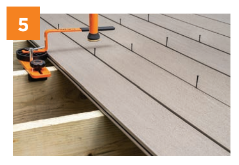
FASTEN EVERY JOIST Fasten all of the remaining clips at each joist.

*FIND MORE SPECIFIC INFORMATION ABOUT EACH CLIP TYPE ON PAGES 8-17.