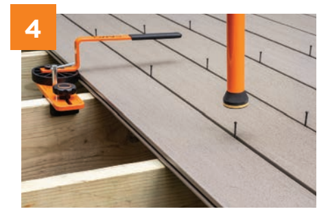
LIFT UP TOOL After fastening, lift up on the tool to return your drill to starting position.

Apply steady pressure and continue to drive until the drill clutch releases or until clip is snug. Do not overdrive.