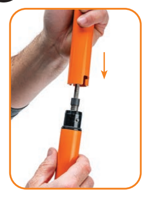
Align the notches in the lower tool body with the locking pins and push down while turning to lock into place.