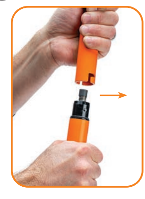
Separate the tool by turning the lower tool body counter-clockwise and sliding the locking pins out of the notches.