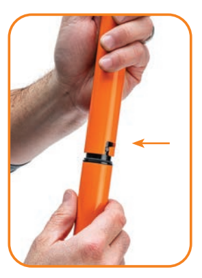
Turn the lower tool body clockwise to lock it into place.