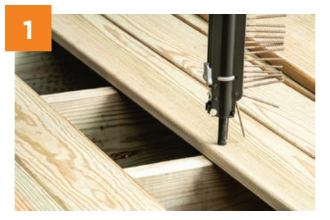
POSITION NOSE PIECE

Starting on the outer edge of the board, line up the nose piece with the joist at least 1 in from the board end and edge.