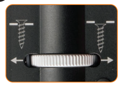
Before fastening on the deck top, drive a few screws into a scrap piece of material and adjust the depth set dial accordingly. For Edge screws, sink them 1/8–1/4 in below the surface of the deck board.