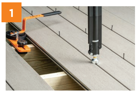
POSITION NOSE PIECE Starting at the outermost board. place

BEFORE YOU BEGIN Lay down rows of boards and clips* and hold or lock them in place.