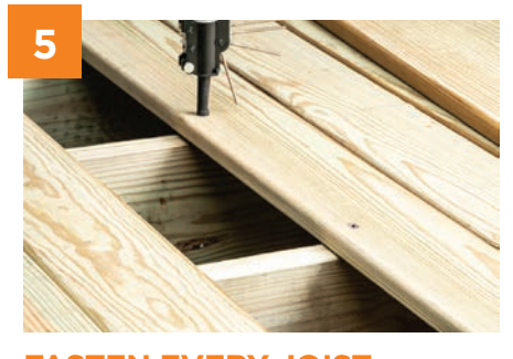
FASTEN EVERY JOIST Install two screws at every joist until the entire board is installed.

After fastening, lift up on the DRIVE tool to return your drill to starting position. The screw will automatically advance.