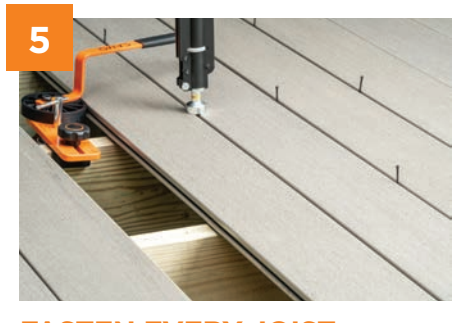
FASTEN EVERY JOIST Fasten all of the remaining clips at each joist.

*FIND MORE SPECIFIC INFORMATION ABOUT EACH CLIP TYPE ON PAGES 8-17.