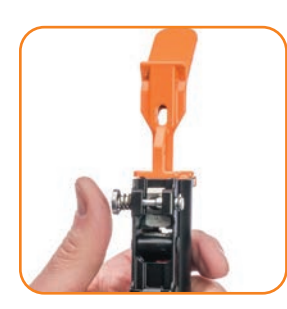
Insert the Edge nose piece. It will lock into place.