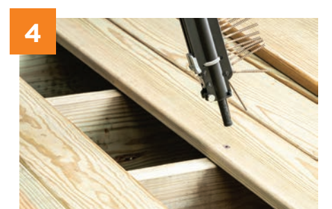
LIFT DRIVE UP

Apply steady pressure, but do not force the screw—it will auger the surface on its own. Continue driving until the drill is fully compressed and the depth release disengages.