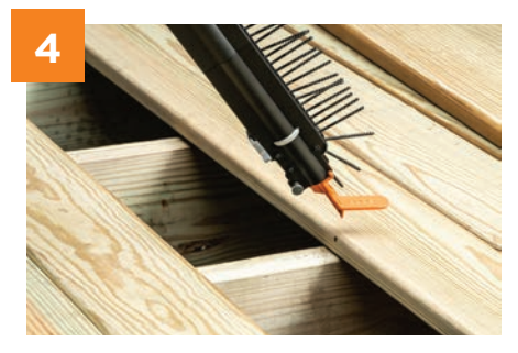
LIFT DRIVE UP

Apply steady pressure, but do not force the screw—it will auger the surface on its own. Continue driving until the drill is fully compressed and the depth release disengages.