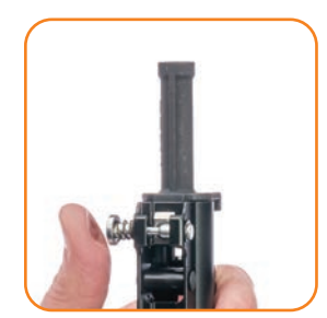
Insert the Face nose piece. It will lock into place.