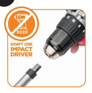
Make sure the drill is set in the forward position. Insert the large collar of the drive shaft into the drill chuck and tighten.