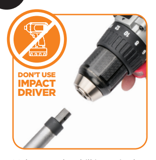
Make sure the drill is set in the forward position. Insert the large collar of the drive shaft into the drill chuck and tighten.