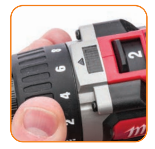
If your drill has a drill and clutch mode, set it to clutch mode. Turn down torque to the lowest setting. Increase as necessary to fully drive screw. Do not overdrive.