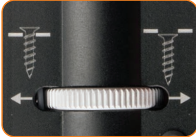
Before fastening on the deck top, drive a few screws into a scrap piece of material and adjust the depth set dial accordingly. For Face screws, you can drive them flush or countersink them.