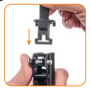
Press the release button.