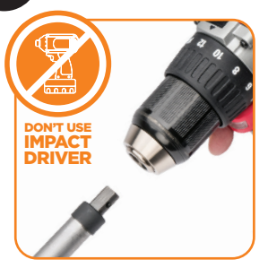
Make sure the drill is set in the forward position. Insert the large collar of the drive shaft into the drill chuck and tighten.