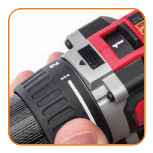
Set your drill to its highest torque setting.