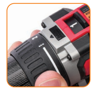
Set your drill to its highest torque setting.