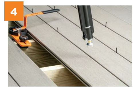
LIFT DRIVE UP After fastening, lift up on the DRIVE tool to return your drill to starting position.

Apply steady pressure and continue to drive until the drill clutch releases or until clip is snug. Do not overdrive.