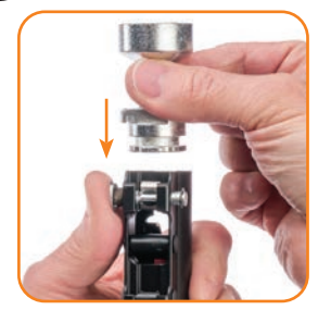
Press the release button.