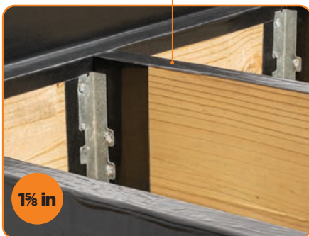
D TOP OF JOISTS