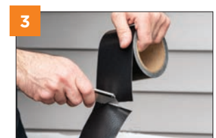
3 CUT TAPE TO THE DESIRED LENGTH