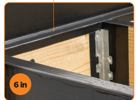
C LEDGER BOARD