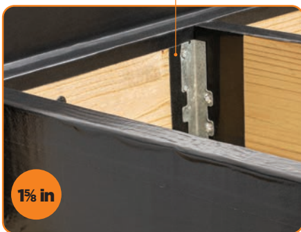
A BETWEEN JOIST HANGERS AND LEDGER BOARD