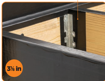
B BETWEEN FRAMING AND JOIST HANGERS