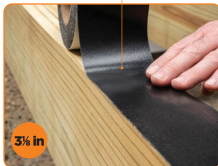
E TOP OF DOUBLE JOISTS