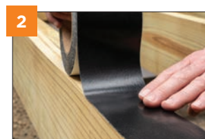
2 APPLY TO THE INTENDED SURFACE AND PRESS INTO PLACE